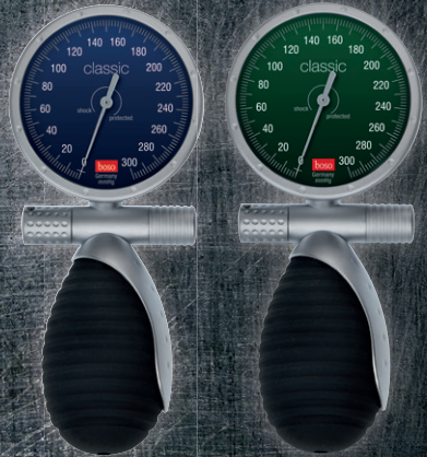
boso classic saturn BS matt chrome, darkblue deal