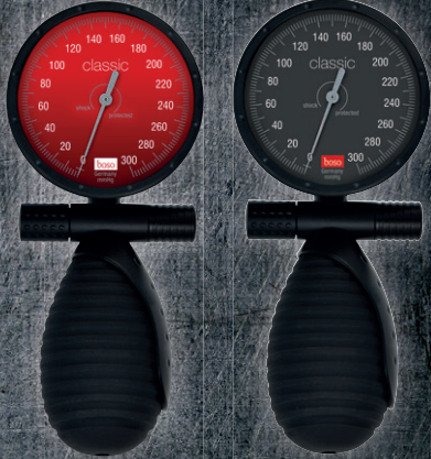
boso classic merkur RS matt black, red deal

- Premium blood pressure instruments since 1922 -